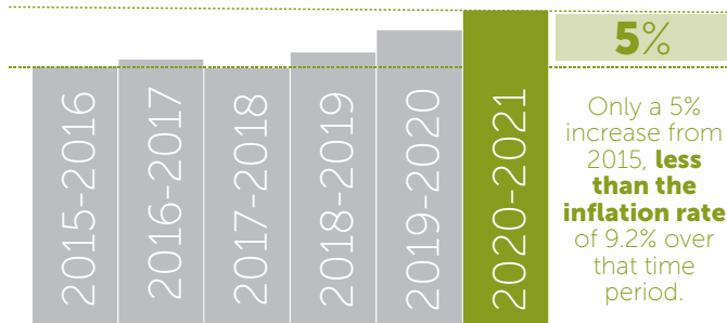
Ohio's in-state tuition and fees at four-year public universities